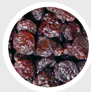
Natural Thompson Seedless