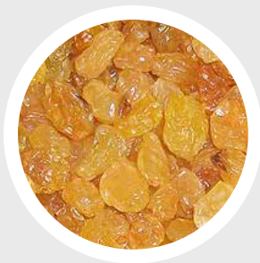
Golden Thompson Seedless